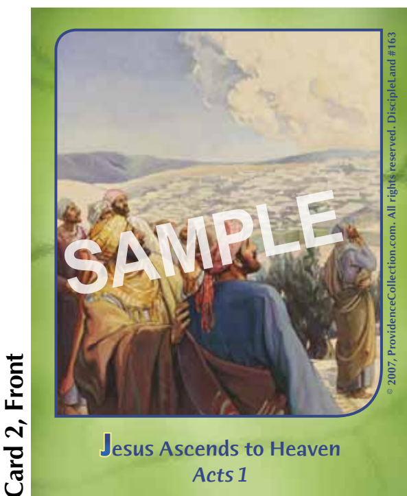
esus Ascends to Heaven Acts 1