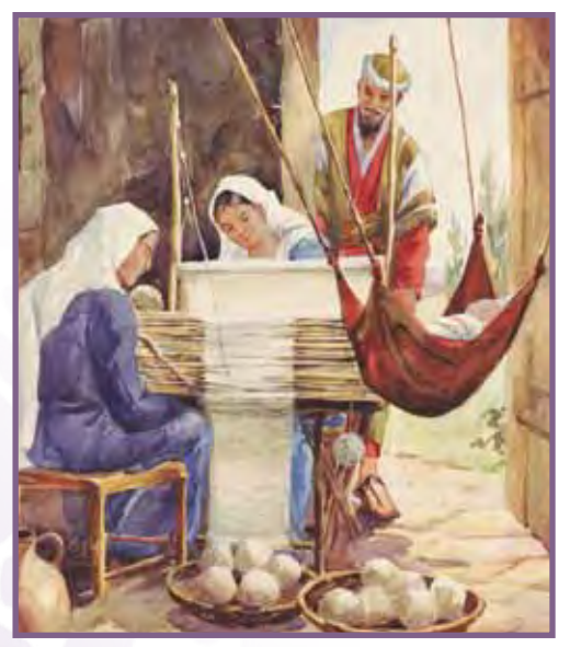
This poster tells how to boost your toddler's spiritual growth!

know the plan. Then stay on schedule. In time, your child will learn to delay gratification and to enjoy the activity at hand.