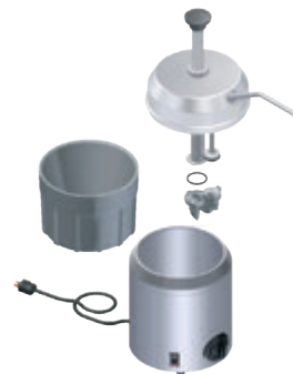
81184 FSP Conversion Kit