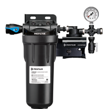
Coldrink/Insurice Manifold with 10" Prefilter: EV9293-01

Coldrink/Insurice Manifold with 20" Prefilter: EV9293-21