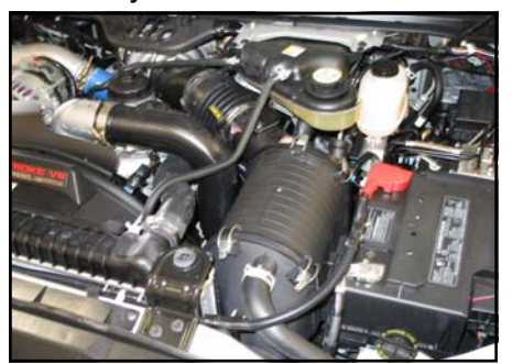
2. Disconnect the radiator overflow. Make sure the system is cold. The tube is under pressure

1. With engine off, disconnect the negative battery cables.