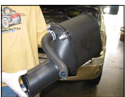
7. Isolate the filter core from the OEM intake tube and OEM snorkel by unclasping the clasps.