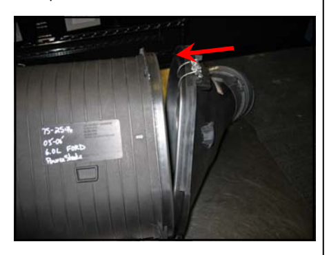
14. Reinstall the intake assembly into the vehicle and secure the prongs on the filter housing into the appropriate grommets.