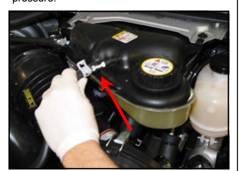
3. Disconnect the electrical connection for the air filter gauge.