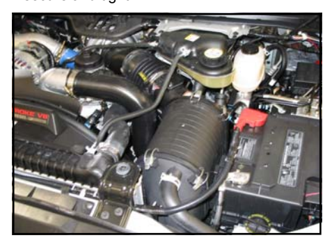
18. Installation is now complete.