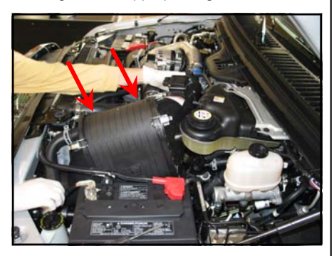
15. Tighten the hose clamp at the turbo manifold. Reconnect the electrical connections for the MAF sensor and the Air Restriction gauge.