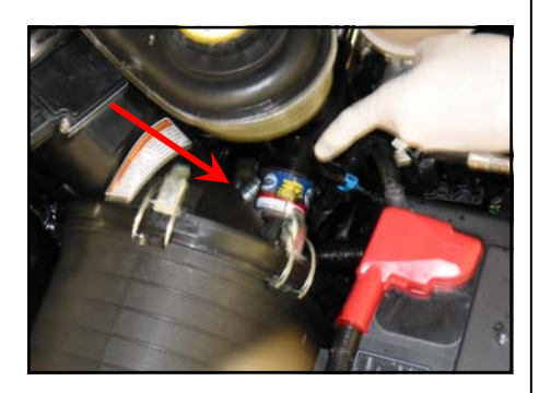
4. Disconnect the electrical connection to the Mass air flow sensor OEM air intake tube and remove the tube. Disconnect the Mass air sensor and remove the sensor from the OEM air box.