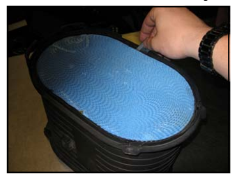
9. Remove the filter from the housing by pushing it out from the opposing side.