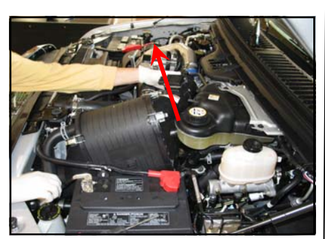
6. b) Remove the complete intake assembly from the vehicle.