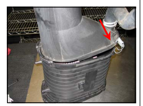
13. Reinstall the intake tube to the filter housing assembly and secure using the clamps.

12. Reinstall the stock snorkel onto the filter housing, and secure using the clamps.