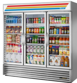
Optional Stainless Exterior