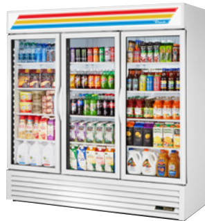
Optional White Exterior