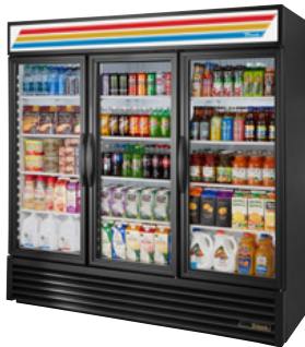
Standard Black Exterior