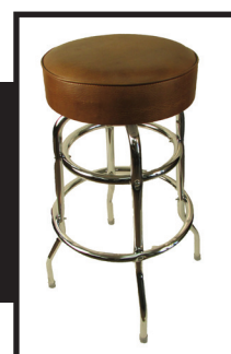
Buckskin SL2129-BUC (Not in CA)