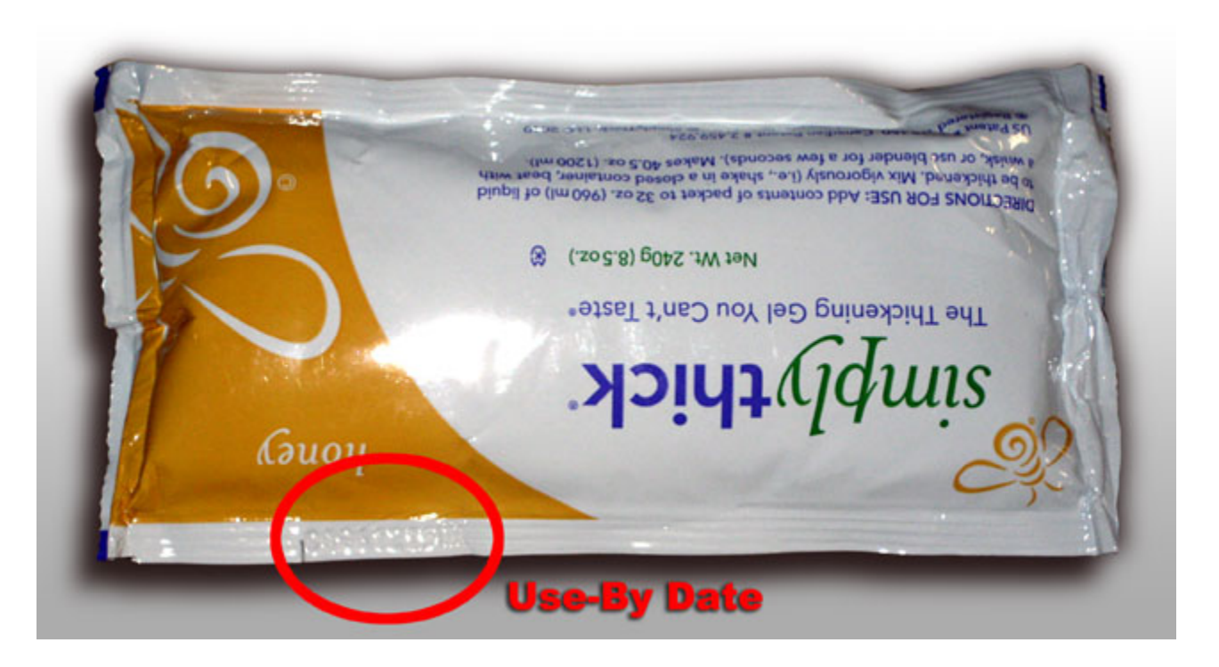
The "W" or "EXP" on packets NOT affected by the recall will appear similar to the images below: