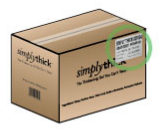
OK TO USE