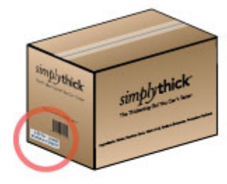
DO NOT USE