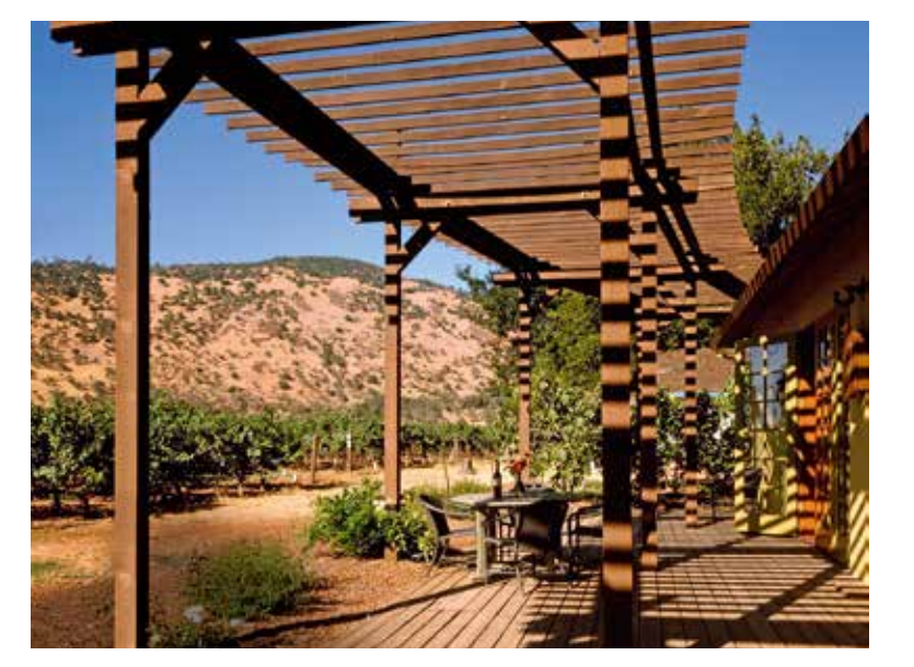
Above: PlumpJack Winery in Napa Valley's Oakville district

Above: Foxglove's vineyards in the Central Coast