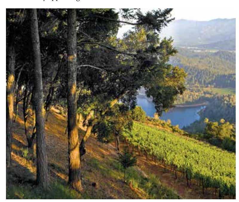
Above: the Cabernet vineyards at Dancing Bear Ranch, owned by Cakebread Cellars, are planted on the slopes of Howell Mountain in Napa Valley