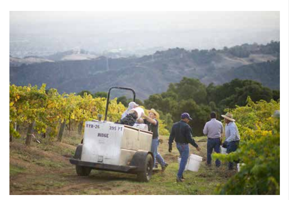
Above: harvesting at Ridge's Monte Bello Estate in the Santa Cruz Mountains

customary egg-white fining, a practice that can refine aggressive tannins but which was deemed unnecessary in 2013.