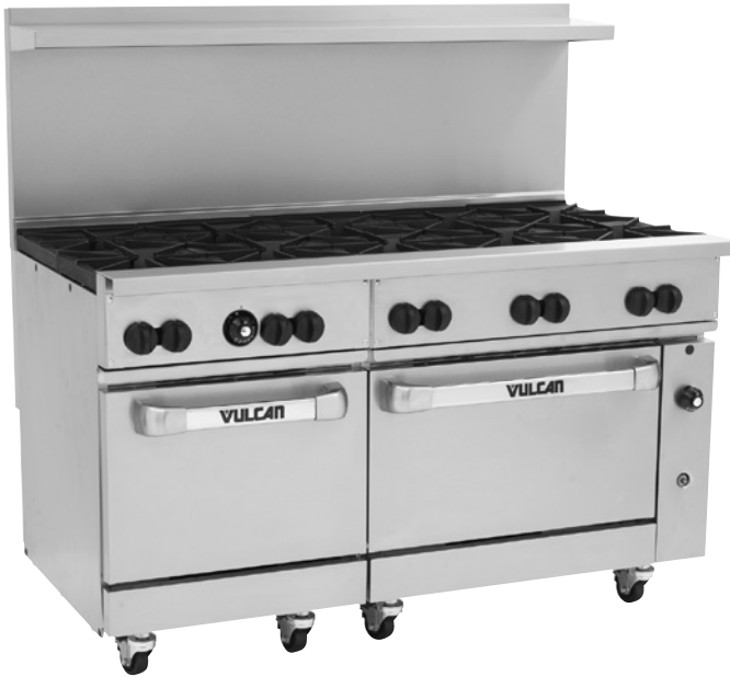
Model 60SS-10BN (shown with optional casters)