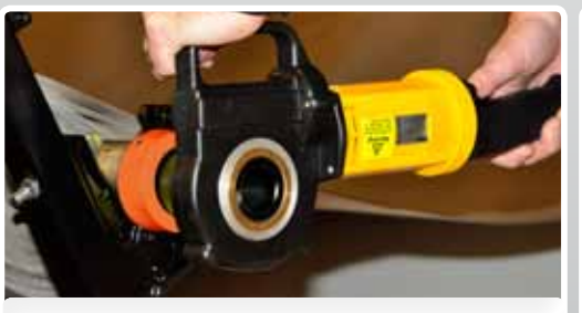
OPTIONAL POWER WINDER