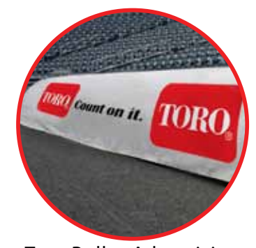
Tarp Roller Advertising