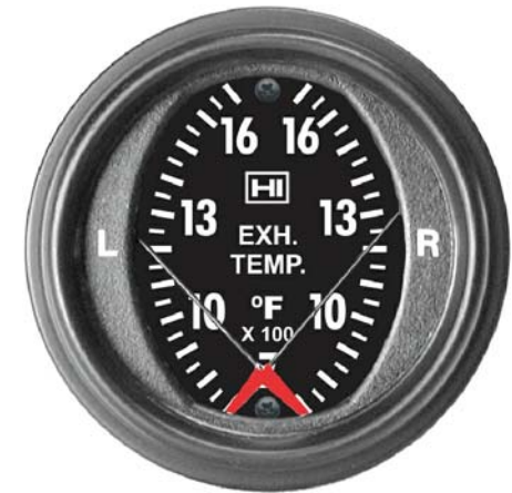
P/N 010-307-1R-4 SCALE 1:1

010-307-XX-X DIAL COLOR POINTER COLOR BEZEL STYLE & COLOR