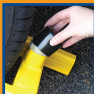
Fig 6 – Securing The Clamp:

Note: it may be necessary to move the assembly from side to side in order to achieve the best fit, which may not necessarily be with the arms resting on the ground.