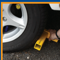
Fig 3 - Rear Arm (C) location:

Place the rear arm behind the right side of the wheel rim as you face it and position the long "nose" so it rests as close as possible to the spoke gaps in the rim.