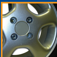
Fig 2: Fitting Locking Wheel Bolts:

20mm Min gap between brake assembly and wheel rim