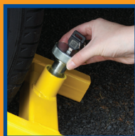
Fig 5 – Fitting The Lock (D):

Holding the rear arm in one hand, offer up the front arm so that its square central tube slides over that of the rear arm and the short front arm "nose" comes to rest in the recess at the edge of the rim, or in one of the spoke gaps.