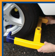
Fig 4 – Front Arm (B) Location:

Note: It may be necessary to angle the arm to achieve this.