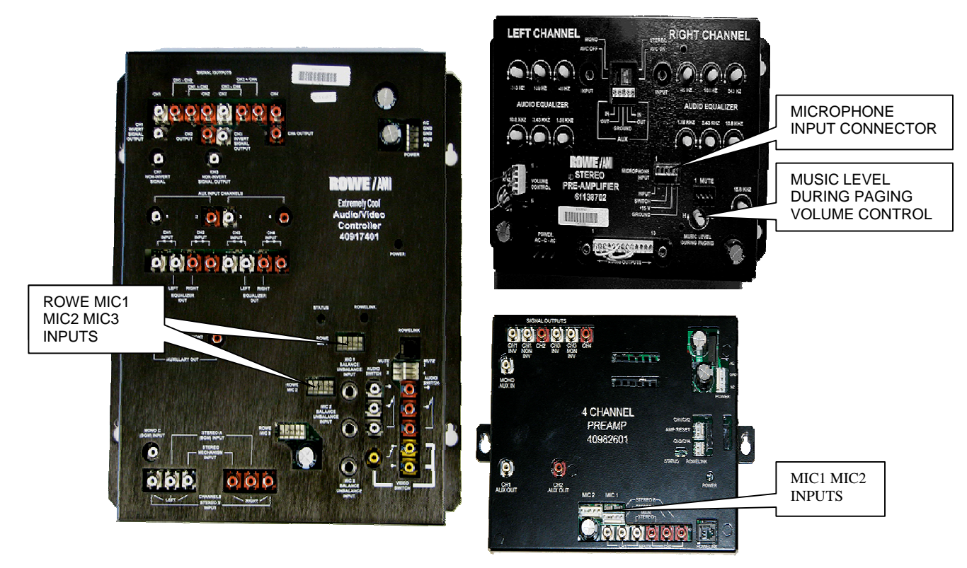
Figure 1 - Jukebox Preamps