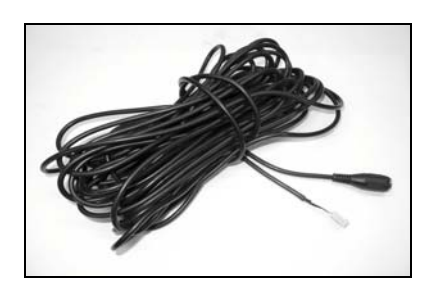
50 ft. Cable