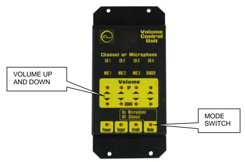
Figure 4 – Presetting the Microphone Volume

11. To preset the Microphone volume on the AV controller and the 4 Channel Preamp locate the VCU (Volume Control Unit) as shown in Figure 4 press the mode switch the "On – Microphone" LED will light set the volume level to 48 by pressing the volume up or down switch. Gradually turn the VOLUME control UP (clockwise) on the Mic Adaptor while talking into the microphone with its push-to-talk switch depressed [refer to Figure 3]. When the volume has been turned up sufficiently you should begin to hear your voice through the jukebox's speakers. Continue turning the control further clockwise until an appropriate microphone volume for paging is obtained.