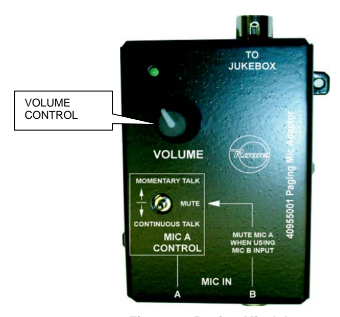
Figure 2 - Paging Mic Adaptor

NOTE : If the power indicator light is not lit this indicates a connection problem may exist between the jukebox and Mic Adaptor. Before proceeding, carefully recheck the 50-foot cable connections at both ends.