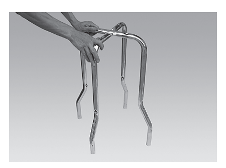
Step 1: Place the two bar stool legs together as shown in the photo.