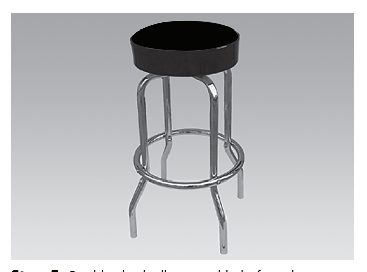
Step 5: Double check all nuts and bolts for tightness.