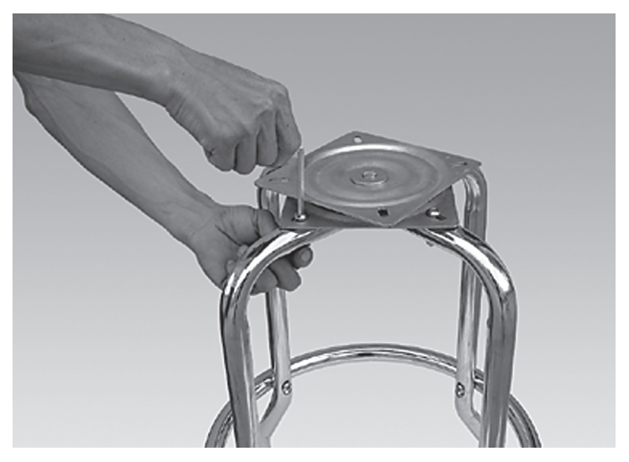
Step 3: Place swivel on top of legs and align holes. Insert large bolts and screw on lock nuts securely.