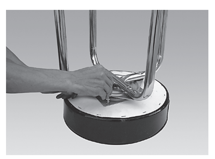
Step 4: Turn the bar stool over and secure the seat to the swivel with medium bolts as shown in the picture.