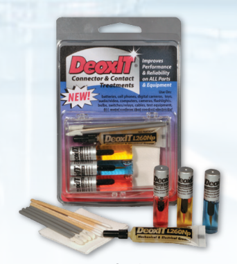
DeoxIT® Sampler Kit: Part No. K-2C