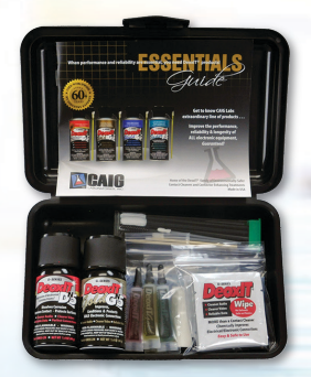
DeoxIT® SURVIVAL KITS Part Nos: SK-AV35 and SK-IN30