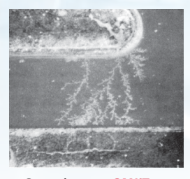
Corrosion you CAN'T see (what lies beneath)