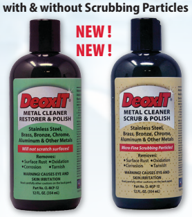
Part Nos.: CL-MCP-12, CL-MSP-12