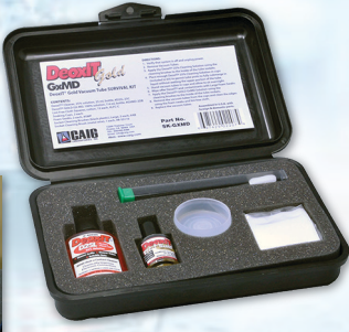
DeoxIT® Gold Vacuum Tube Survival Kit Part No. SK-GXMD