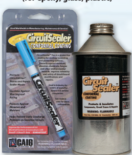
Part Nos.: CS100P (precision pen), CS100L-12 (354 mL)

Conformal Coating (for epoxy, glass, plastic)