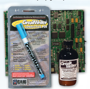
Part Nos.: CW100P (precision pen) CW100L-4 (125 g), CW100L-32 (1000 g)

Conductive Silver Coating (for rubber, epoxy, glass, plastic)