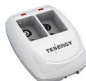
Item No. 01141 TN141 2-Bay 9V Battery LED Fast Charger