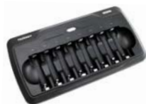
Item No. 01157 TN157 8-Bay Battery LED Fast Charger