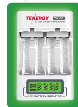
----- TN156 ----- LCD Fast Charger For AA/AAA Ni-MH Batteries