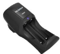
Item No. 01153 TN153 2-Bay Battery Standard Charger

Distributed by Tenergy Corporation www.tenergybattery.com 436 Kato Terrace, Fremont, CA94539, USA Tel: (510) 687-0388, Fax: (510) 687-0328