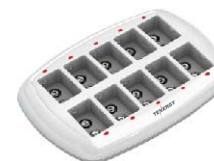
Item No. 01137 TN137 10-Bay 9V Battery LED Fast Charger