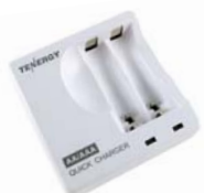
Item No. 01142 TN142 2-Bay Battery Fast Charger