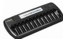
Item No. 01140 TN140 12-Bay Battery LCD Fast Charger