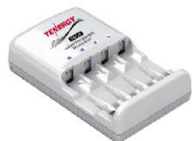
Item No. 01138 TN138 4-Bay Battery LED Fast Charger