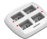
Item No. 01136 TN136 4-Bay 9V Battery LED Fast Charger