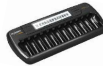
Item No. 01140 TN140 12-Bay Battery LCD Fast Charger