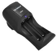
Item No. 01153 TN153 2-Bay Battery Standard Charger

Distributed by Tenergy Corporation Fremont, CA 94539, USA Tel: (510) 687-0388, Fax: (510) 687-0328 www.TenergyBattery.com