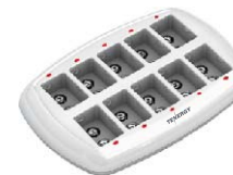
Item No. 01137 TN137 10-Bay 9V Battery LED Fast Charger