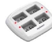
Item No. 01136 TN136 4-Bay 9V Battery LED Fast Charger