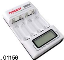
Item No. 01156 TN156 4-Bay Battery LCD Fast Charger

Input: 100-240V AC 50/60Hz Output: 1.2V DC 1000mA; AAA: 500mA per channel