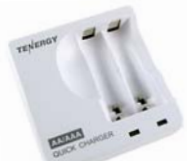
Item No. 01142 TN142 2-Bay Battery Fast Charger

Input: AC 120V 60Hz Output: AA/AAA 1.2V DC 150mA per channel