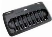
Item No. 01157 TN157 8-Bay Battery LED Fast Charger