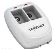
Item No. 01141 TN141 2-Bay 9V Battery LED Fast Charger