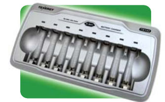
----- TN145 ----- Battery Charger For AA/AAA Ni-MH Batteries

Please read this manual carefully. It contains important operating instructions. This battery charger can charge all AA or AAA Nickel Metal-Hydride (Ni-MH) and Nickel-Cadmium (Ni-Cd) rechargeable batteries.