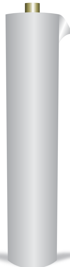
6' X 45' ROLL