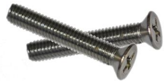
Set of 2 shorter screws