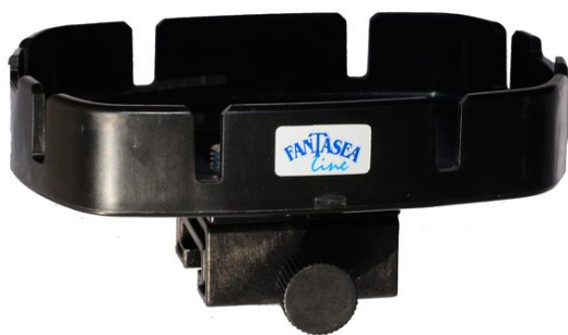
EyeGrabber Canon G Series